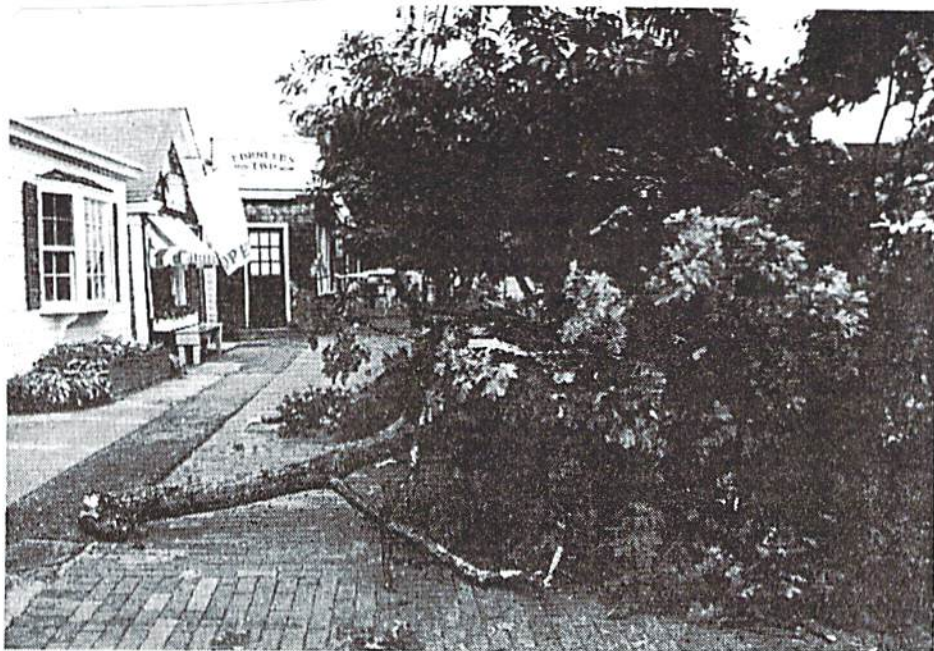
A tree in front of Scoops broke off.